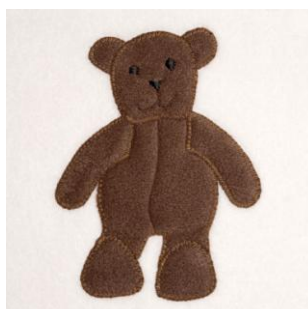
“Ernest” Teddy Bear

Of course, if you have any suggestions, please email me at info@coodgycoodgycoo.co.uk